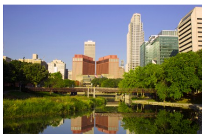
A river runs through it...